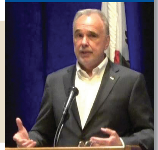
Senator Mike Morrell , R-Rancho Cucamonga, gave an insider's view from Sacramento, where advocates for taxpayers have their work cut out for them.