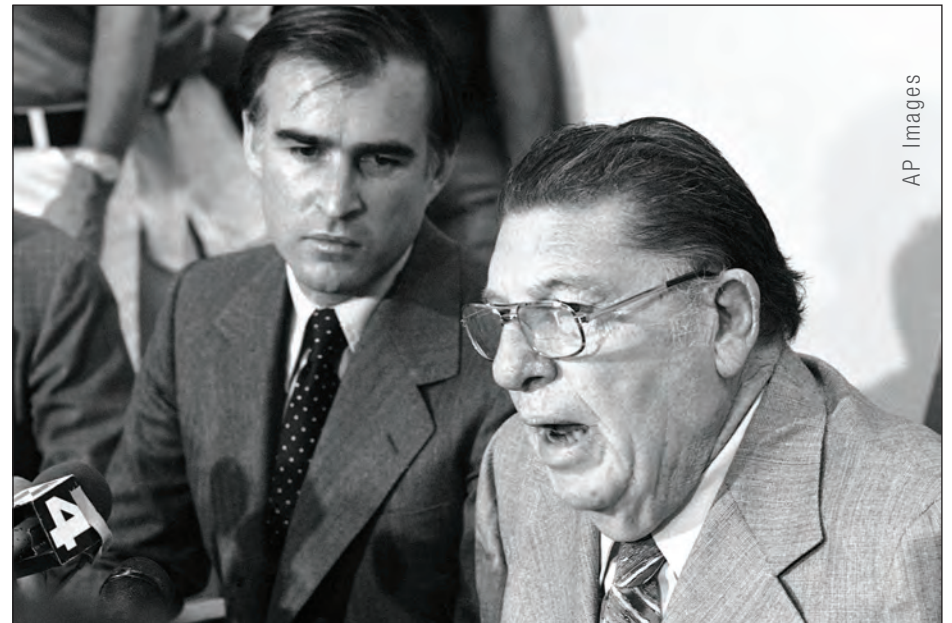
In 1978 Howard Jarvis and Jerry Brown clashed over Proposition 13.

For taxpayers, the key to success, Howard believed, could be summed up in the words of James F. Byrnes, Secretary of State in the Truman Administration, who said, “I discovered at an early age that most of the difference between average people and great people can be explained in three words: ‘And then some.’” Howard