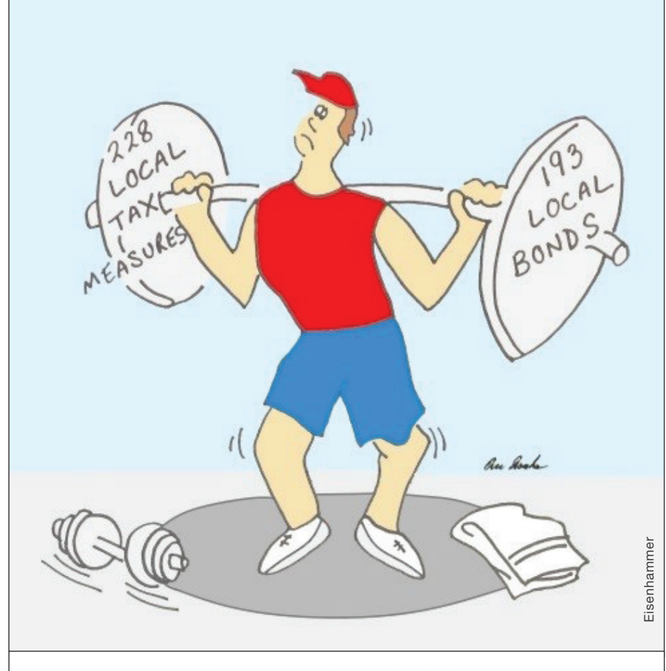
Heavy taxes on November ballot.

The governor vetoed a bill HJTA opposed, SB 1094, that would have required unpaid volunteers to gather at least five percent of the signatures to qualify an initiative. Not only do the costs of coordinating volunteers tend to be more expensive, but SB 1094